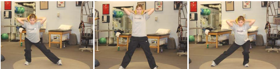
Hands Behind Head (5-10ea)