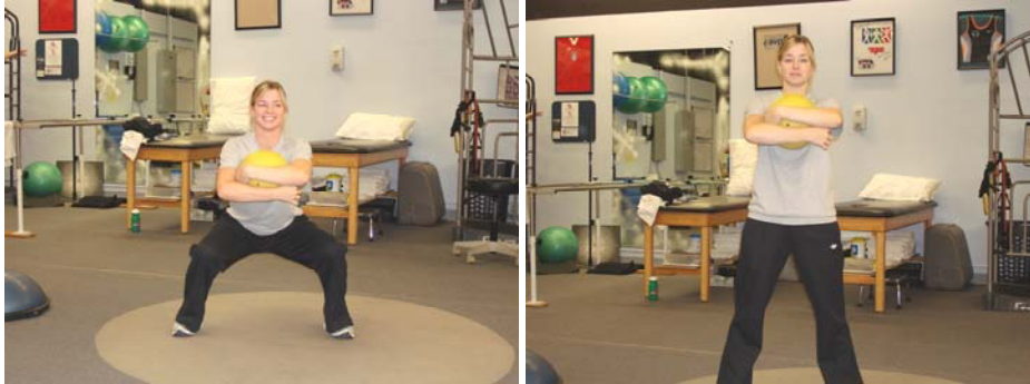
Arms Across Chest (5-10 ea)