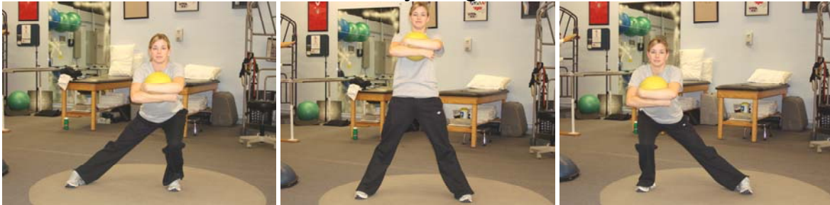
Arms Across Chest (5-10 ea)