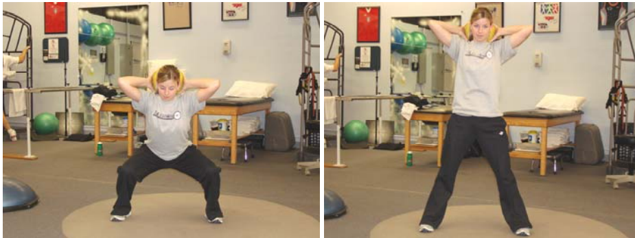
Hands Behind Head (5-10ea)